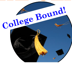
Home to Campus pg4